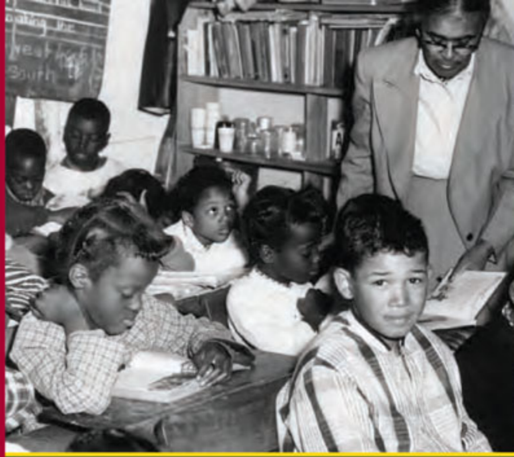
(Above Left) Hampden Sydney Training Center, Classroom, c. 1961. Site No. PE7 on the Civil Rights in Education Heritage Trail®

Virginia has led the nation in many ways, particularly in education. The birthplace of the free public education system our country now enjoys has its roots right here in South Central Virginia. It was here that through combined grassroots efforts that African Americans, Native Americans and women struggled for the right to an education equal to that of white males. Today, a self-guided driving tour brings together these historically significant sites telling the poignant and often explosive story of civil rights in education in our country.