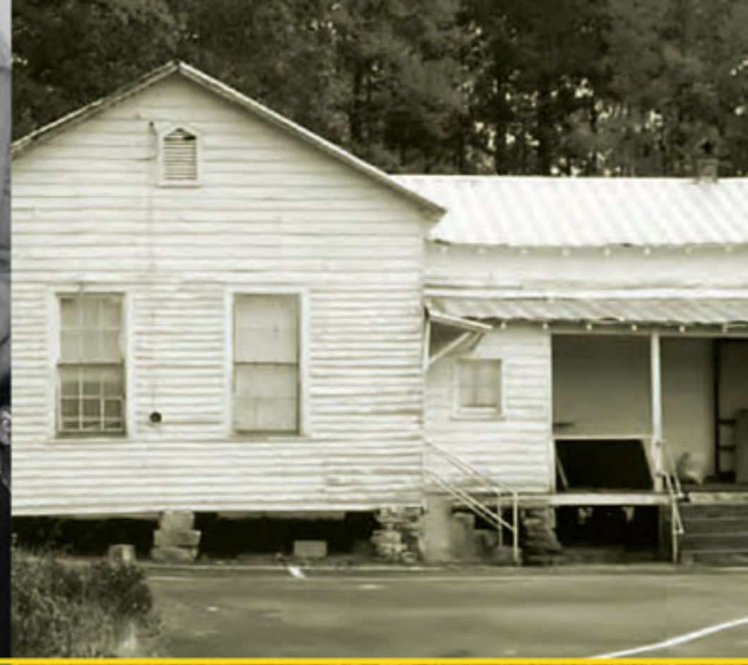
(Above Right) Dinwiddie County, Rocky Branch School Building, c. 1930s. Site No. DN2 on the Civil Rights in Education Heritage Trail®