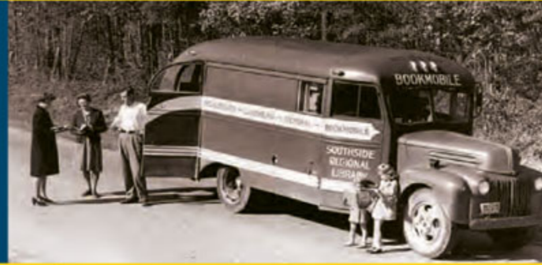
(Right) Charlotte County Library Bookmobile, c. 1939. Site No. CR2 on the Civil Rights in Education Heritage Trail®