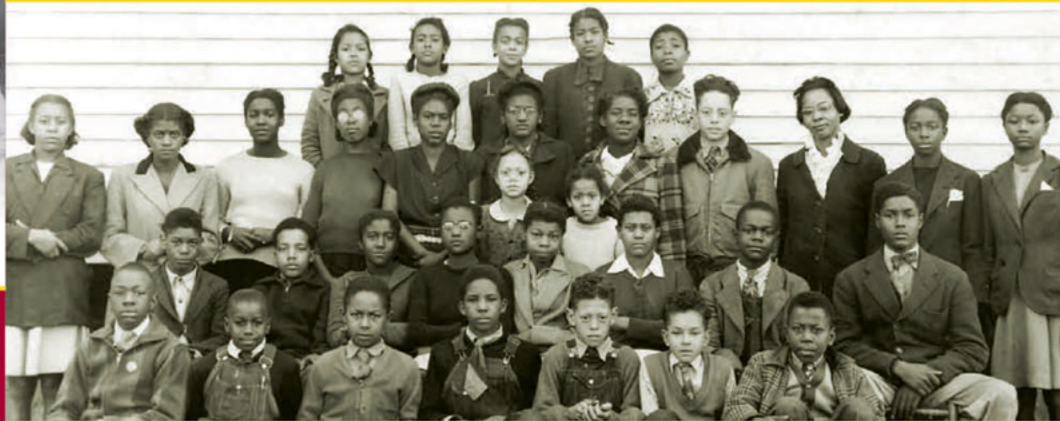
Charlotte County, Salem School, grades 5, 6, & 7 in 1947. Site No. CR4 on the Civil Rights in Education Heritage Trail®